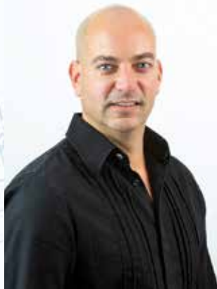
By Ken Endt , Cipriani Remodeling Solutions Expert Contributor

B efore a single hammer swings or a tile is laid, the successful outcome of your remodeling project is determined by one critical phase. It isn't the demolition, framing, or even selecting the materials and beautiful finishes. It is the design process — the discovery of needs, thoughtful planning, and documentation of a project.